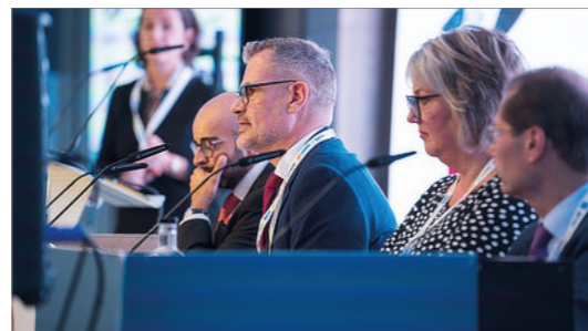
▶ Expert group: Representatives from across the construction sector joined the panel discussions