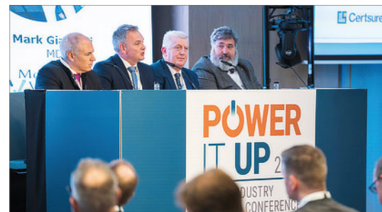
◀ Now we're talking: Panellists at the Power It Up conference following the ECA's presentation